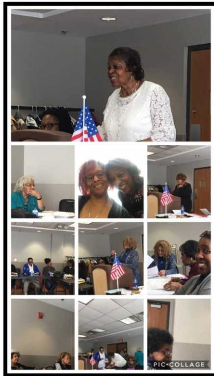
Detroit Unit Meeting