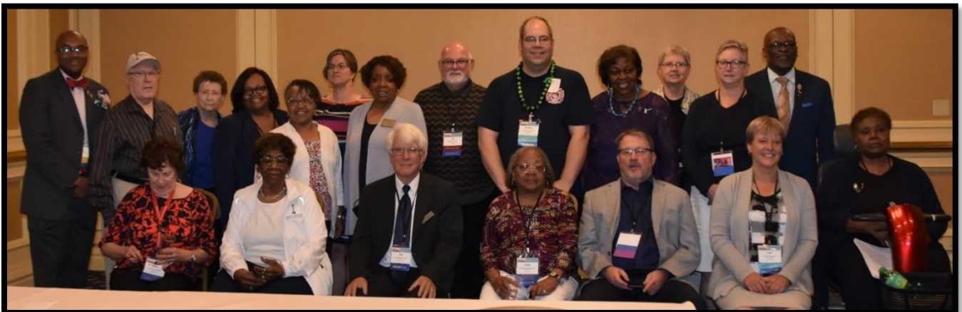
Past NAP Presidents and International and District 4, State, and Unit Officers at NAP Conference, Las Vegas 2019