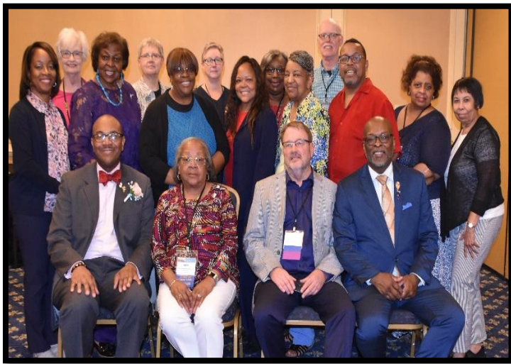
MSAP Members with NAP Officers at NAP Conference Las Vegas 2019