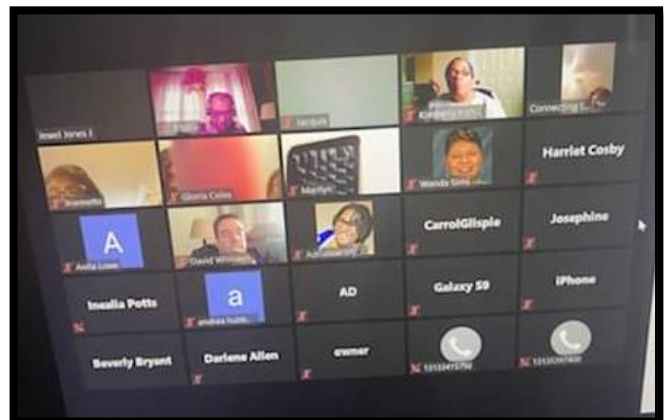
NAP Officers at Detroit Unit Zoom March 2020 Meeting