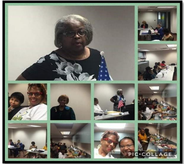
Detroit Unit Meeting