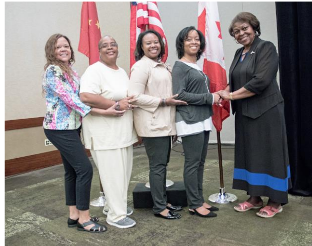
Detroit Unit Members